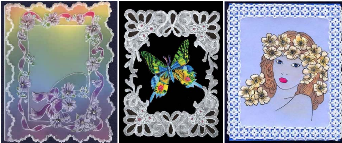
Figures A, B & C

If you are creative in the art of parchment or pergamano, we may be interested in using your designs for graphics on the Boutique Narelle website. (See figures A, B and C or browse this website to view more lovely examples of parchment craft: http://www.pergamanoweb.nl/Pergamano/pergamano.html ) If you enjoy some other type of art which you feel may benefit our web graphics, we'd like to hear from you as well!