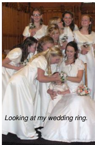
Looking at my wedding ring.

In newsletter ID040, I wrote about how encouraged I was that so many of you readers have your own ministries to younger girls. I commented that our mothers more often than not did not have Titus 2 women in their lives, but that our generation may be the generation which brings back the Titus 2 woman. We are doing it by asking older women to share their wisdom, by studying and applying Titus 2 and by building relationships with younger girls (including sisters!), encouraging them, being a witness to them and pointing them in the right direction.