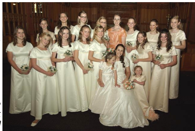
The 14 maiden daughters as well as my three sisters and myself.

I want to encourage you to look at the younger girls at Church and to think about your influence in their lives and how that can be an influence for good in a world which is trying to influence them for bad.